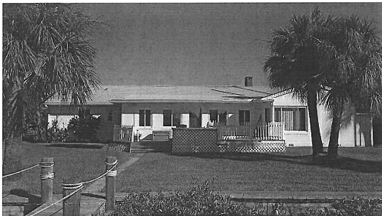
REAR VIEW OCT 27, 2013

If submitting more photographs than will fit on the preceding page, affix the additional photographs below. Identify all photographs with: date taken; "Front View" and "Rear View"; and, if required, "Right Side View" and "Left Side View." When applicable, photographs must show the foundation with representative examples of the flood openings or vents, as indicated in Section A8.