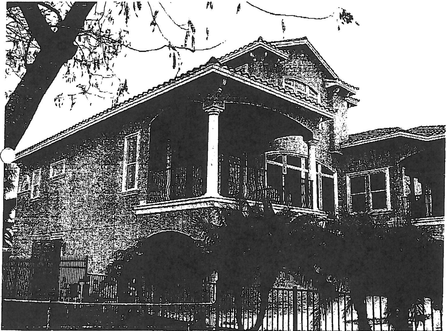
REAR RIGHT VIEW 02/24/10