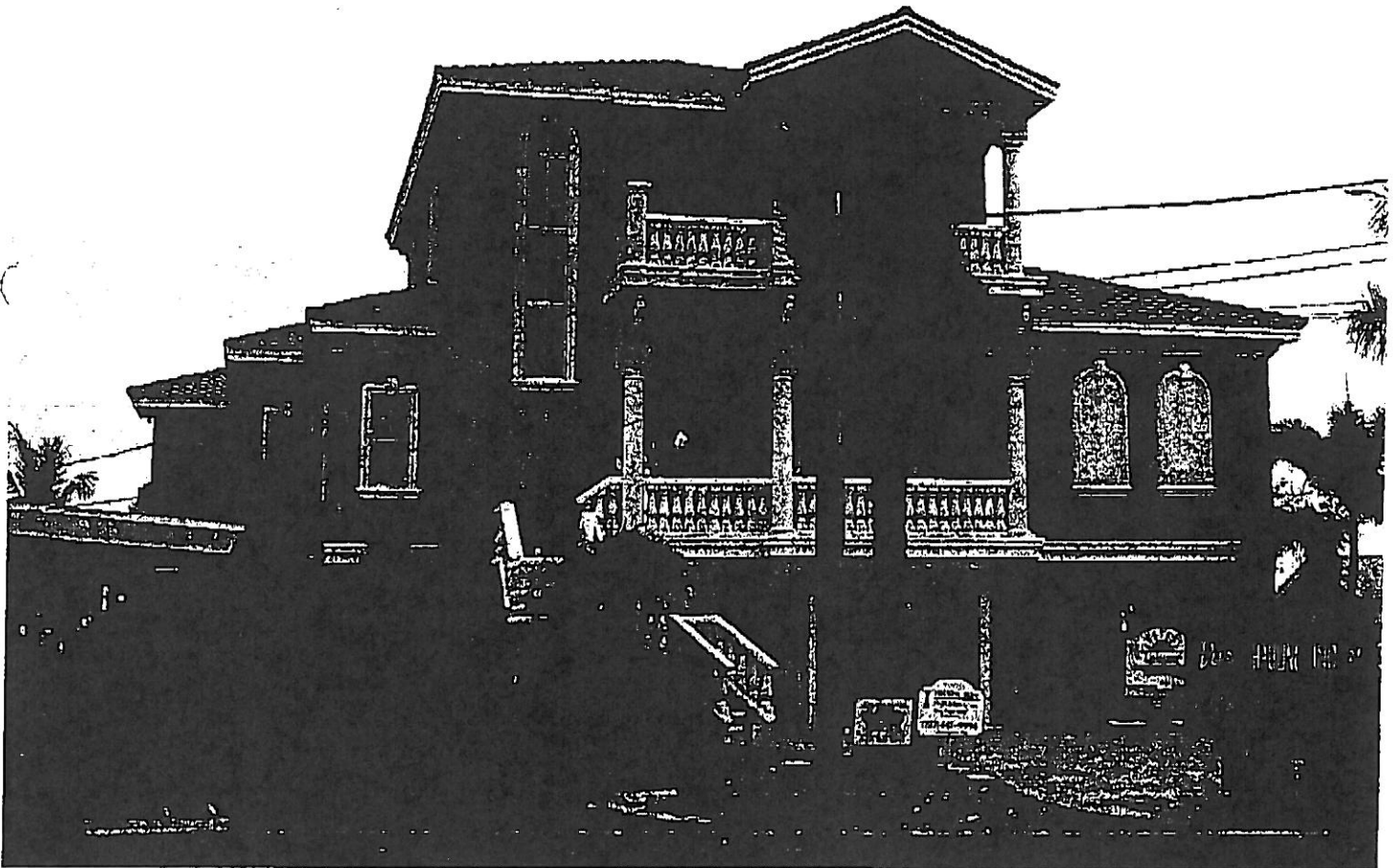
FRONT VIEW 02/24/10