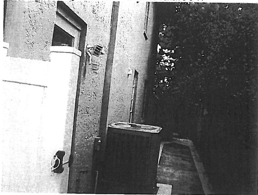
"Left Side View" – Pictures Taken 8-9-11