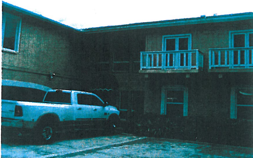
"Rear View" – Pictures Taken 8-9-11