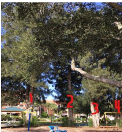
Trees to be removed, numbered 1-4.

Please be aware that in the coming weeks, there will be a tree removal company in Town Park removing the four Australian Pines which are shown in the picture, below. The removal of the trees is necessary due to their new growth encroaching into the playground area creating a safety issue. This invasive species will be replaced with a native species, Eugenia foetida stopper, as shown in the second picture, below.